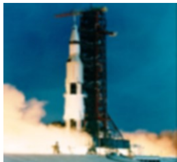
Neil Armstrong's spacecraft — Apollo 11

“This is one small step for a man, one giant leap for mankind”.