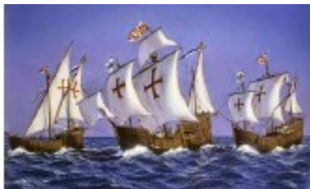
Christopher Columbus's ships